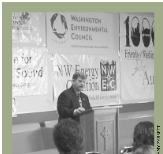
Rep. Cooper was one of the legislators who addressed the Lobby Day

WEC and WCV also have elevated shorelines as a