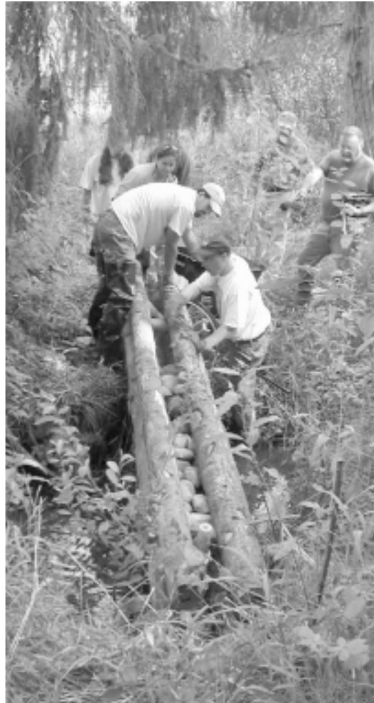
FRIENDS OF HYLEBOS WETLANDS