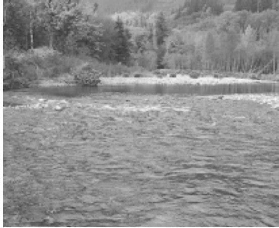
The Stillaguamish River could become one of the few rivers in the state to have its waters get enhanced protection in the last 20 years.

For only the second time in 17 years, the Department of Ecology (Ecology) is proposing new instream flow protections, intending to adopt a rule for the Stillaguamish River by the spring of 2004. In essence, an instream flow establishes a water right for water to remain in our rivers and streams. The